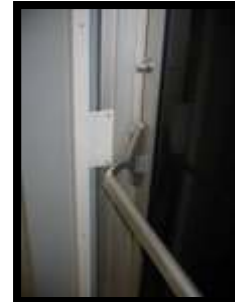
Back bracket with post

When encountering rubber mats, grids, etc. at front doors, advise store manager that gate should be "EASED" across, not forced to avoid breaking caster wheel.