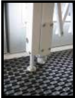
Shoot pin and plunger

Drill a new hole on the stand off flange to accept carriage bolts. Do not drill through the main frame of the door from one side only...drill from each side to avoid wiring inside frame..